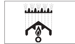
BURNER HEATS RADIANT WHICH RADIATES HEAT TO THE GRATE AND FOOD ITEM.