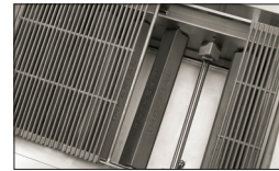
STAINLESS STEEL BURNERS WITH CAST-IRON RADIANTS.