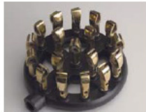
Jet burners are available in 18, 23 and 32 tip styles.