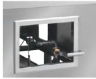
Knee level "L" shaped handle on jet burners conveniently adjusts gas keeping hands free for cooking.