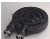
3-ring burner has two adjustable gas valves for inner and outer rings.