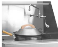
Water cooled top and built-in drain system help control stove top temperature.