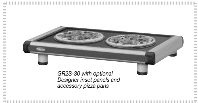
GR2S-30 with optional Designer inset panels and accessory pizza pans